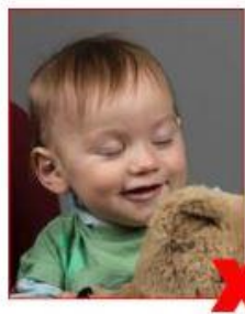
Eyes not open/toy visible