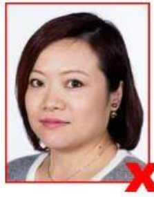
Side on to camera