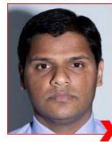
Shadows on image and background