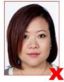
Hair obscuring face