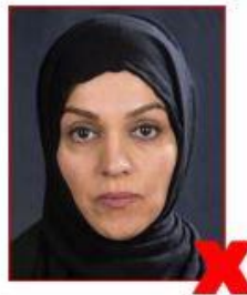
Background too dark