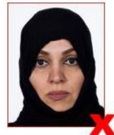
Eyes/edges of face obscured