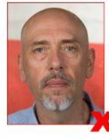
Background not plain